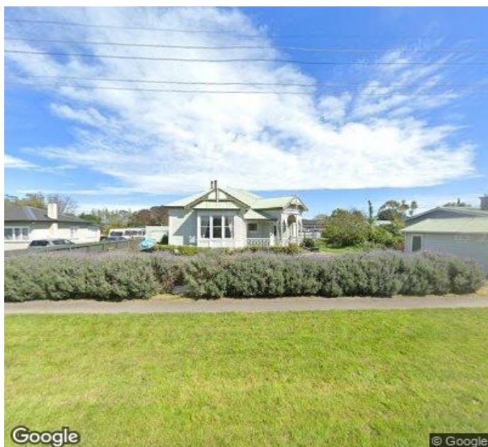
Google Google Streetview Image

Information on this plan is indicative only and not mapped to a survey accurate scale. Gisborne District Council accepts no liability for its accuracy and it is your responsibility to ensure that the data contained herein is appropriate and applicable to the end use intended. The information included in this report is indicative only and does not purport to be a complete database of all information in Gisborne District Council's possession or control. Gisborne District Council shall not be liable for any loss, damage, cost or expense (whether direct or indirect) arising from reliance upon or use of any information provided, or Council's failure to provide this report. Copyright under Creative Commons Attribution 4.0 International licence. May contain data sourced from the LINZ Data Service, BOPLASS or Gisborne District Council. For more detailed information relating to this property please request a Land Information Memorandum report from Gisborne District Council - http://www.gdc.govt.nz/land-information-memorandum-lim/